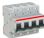
ABB Eco Solutions™